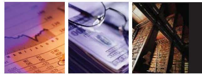
Benjamin Graham Small Cap Value ELEMENTS SM Exchange-Traded Notes