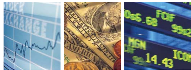
Benjamin Graham Total Market Value ELEMENTS SM Exchange-Traded Notes