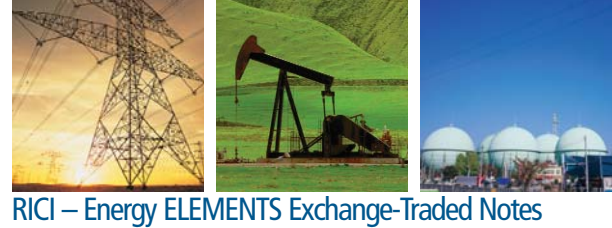
RICI – Energy ELEMENTS Exchange-Traded Notes