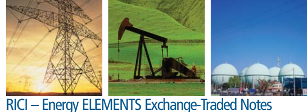
RICI – Energy ELEMENTS Exchange-Traded Notes