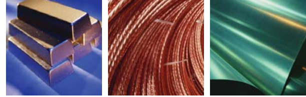
RICI – Metals ELEMENTS Exchange-Traded Notes